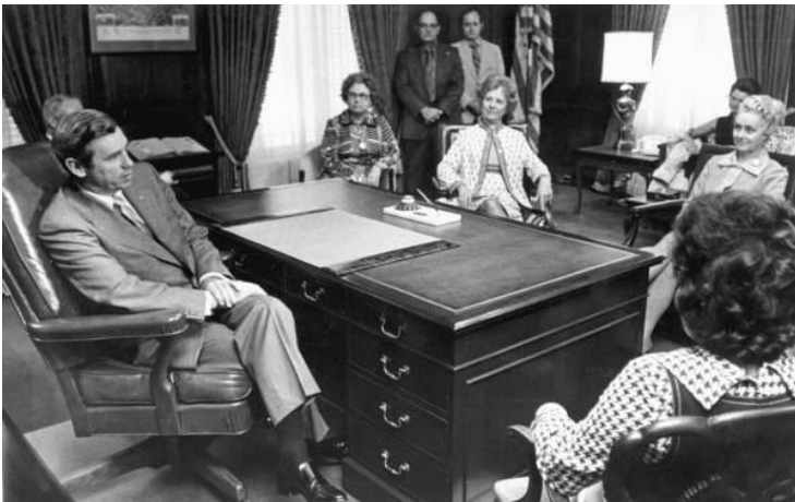
Governor Reubin Askew meets with a delegation of Floridians, 1972

These series originate from the Executive Office of the Governor and include correspondence, meeting, administrative, survey, budget, subject and conference files on women's issues, as well as Women's Hall of Fame nomination files. These series have a variety of creators: governors and their wives, staff members and appointed cohorts. Also included are records that document the work of relevant commissions due to their creation by executive order and administrative position within the Office of the Governor.