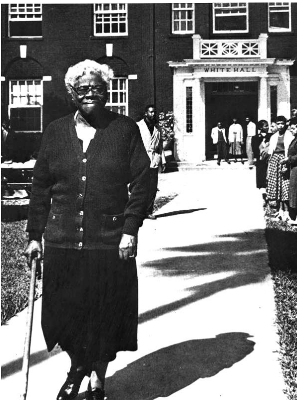
Mary McLeod Bethune in front of Bethune-Cookman College's White Hall, ca. 1940s