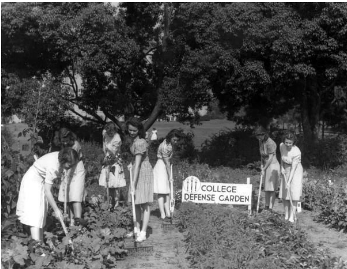
Students tending the Florida State College for Women's College Defense Garden, 1942

This section is organized by the creating agency, then by the agency's record series that relates to women's history and women's issues in Florida. Some agencies have several series listed due to their frequent involvement in projects, initiatives and everyday work relating to women. Several series document women in high levels of management, such as Secretary of State, Secretary of Administration, State Librarian and Archivist, and Chancellor of the Board of Regents. Several series concern education for women in Florida, including several from the Florida State College for Women, predecessor to Florida State University, and other series pertain to equal educational and employment opportunities for women at Florida public universities. Some series document women's rights and health issues such as voting rights, the Equal Rights Amendment, equal employment opportunities for women, family planning and midwifery.