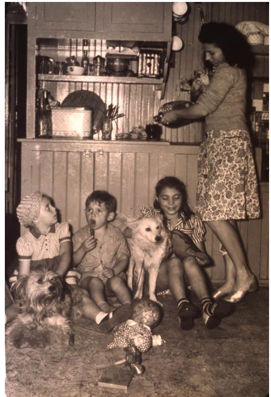
In the kitchen with mother and kids, n.d.