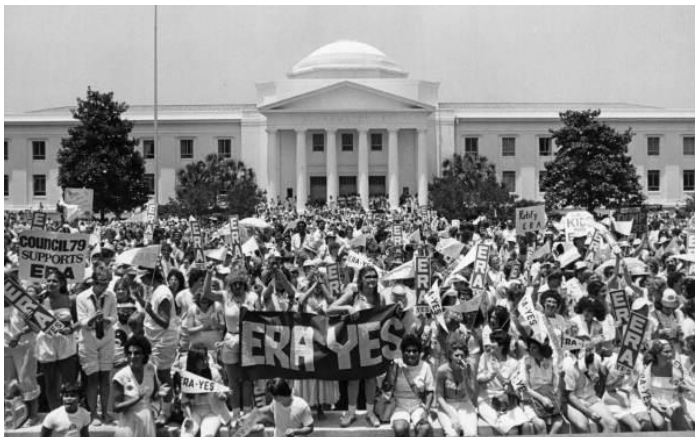
Junior Women's Club of Miami Officers, 1927 Equal Rights Amendment March on Tallahassee, 1982